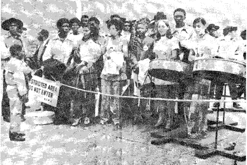
AWARD WINNING VIRGIN ISLANDS performers in the annual Tournament of Roses parade on New Year's day arriving back home at Harry S Truman Airport on Sunday afternoon. The 15 steel band members and four beauty queens were welcomed back by the Sts. Peter and Paul High School steel band