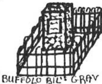
BUFFALO BILL'S GRAY